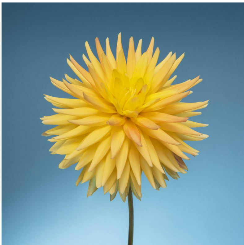
Untitled 2022 43.25 x 43.25 inches Framed in White Inkjet print on photo papers $3,500