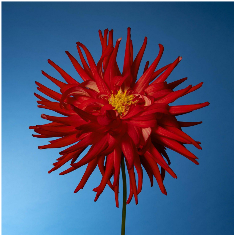
Untitled 2022 40 x 40 inches Unframed Inkjet print on photo papers $3,000