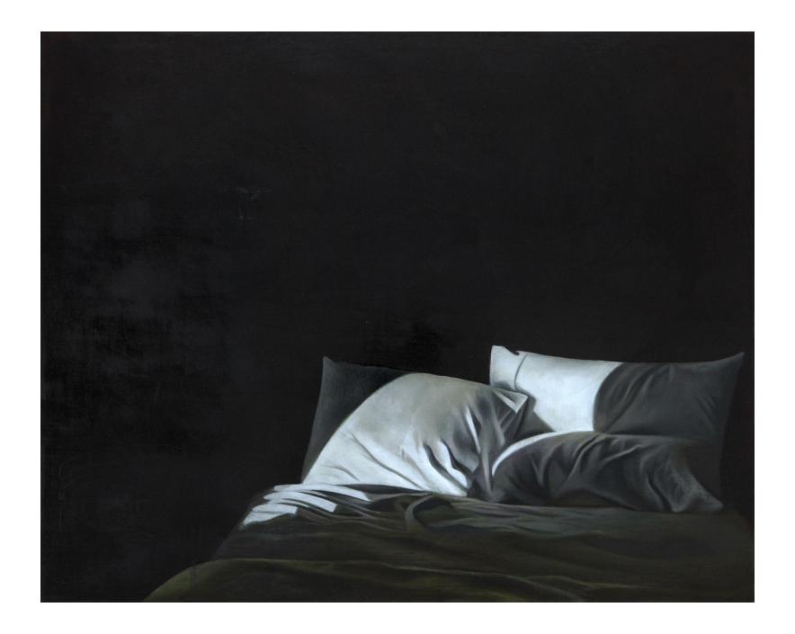
A New Fall #18 (2018) Stephanie Serpick Oil on Panel 16 x 20 inches $5,000